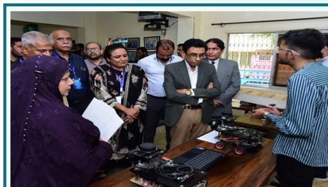
Chief Guest during his visit at PCSIR student's stall.

All dignitaries and other delegations paid visit to the IIEE Science Projects Display Center. The Chief Guest encouraged students to promote and submit their projects to the Pakistan Science Foundation (PSF) for funding. In the end of inaugural session, souvenirs were distributed among organizers, speakers and panelists by the Chief Guest.