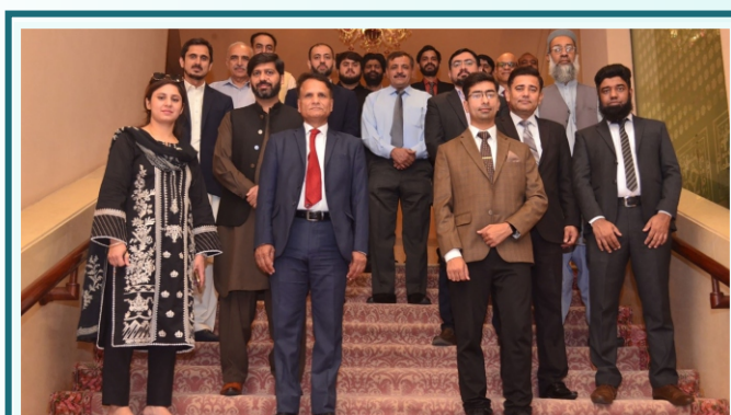
Group photo of participants and experts during closing ceremony of Survey of Pakistan's PSDP project "Feasibility Study for Establishment of NSDI for Pakistan" at Serena Hotel, Islamabad.