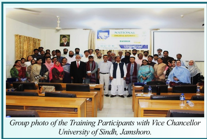
Group photo of the Training Participants with Vice Chancellor University of Sindh, Jamshoro.

PASTIC in collaboration with University of Sindh, Jamshoro organized a one day project awareness and training workshop on June 12, 2024 to empower the Journal Publishers community with modern Journal publishing tools and techniques. Sixty Five consortium members from Sindh region participated in the project awareness and training activity. The said Activity was performed under development project titled “National Digital Archive of Research Published in Pakistani Journals” which aims to provide single electronic-platform to Journals publisher’s community for preservation and dissemination of research published in indigenous research Journals.