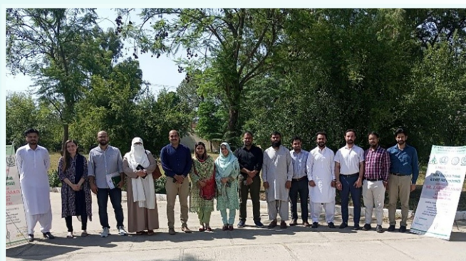
Group photo of the participants of five days training workshop at HDIP.

Participants learned into various software tools and statistical techniques to effectively manage and visualize geochemical data. Various data analysis techniques like Exploratory Data Analysis, Clustering, Regression, Time series analysis and Principal Component Analysis were performed using geochemical datasets. This initiative marks a significant step towards enhancing expertise in geological and geochemical data analysis of geologists working at HDIP. At the end of training, certificates were distributed among participants and souvenirs among resource person and organizers.