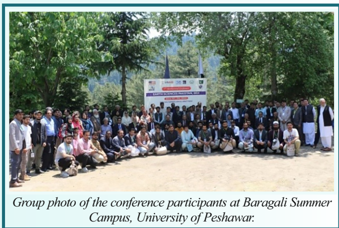
Group photo of the conference participants at Baragali Summer Campus, University of Peshawar.