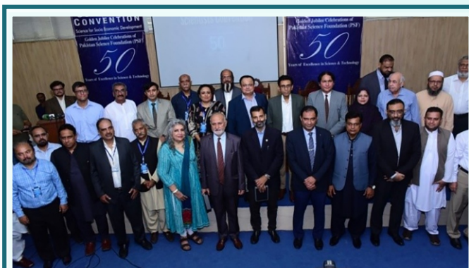
Group photo of the Keynote speakers & organizers with the Chief Guest.