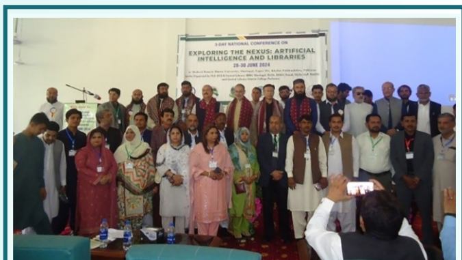
Group photo of the participants of 03-Days National Conference on "Exploring the Nexus: Artificial Intelligence and Libraries" at SBBU-Sheringal-Upper Dir.